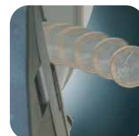
High payout speed