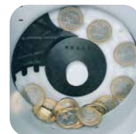
Last coin payout